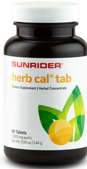
90 tablets #26041