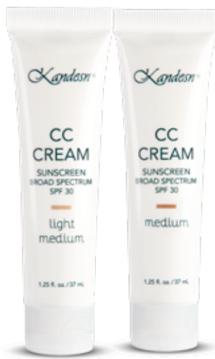
Light Medium 1.25 fl. oz. Medium 1.25 fl. oz.