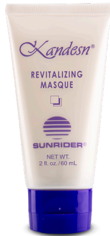
2 fl. oz. / 60 mL #01242