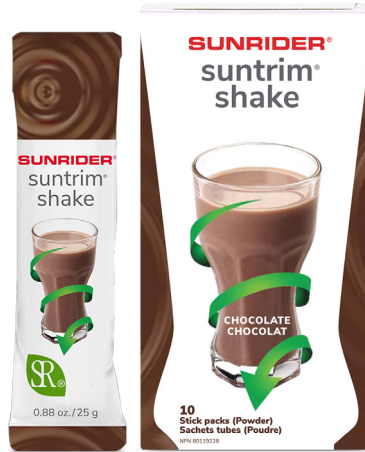
Chocolate 10/25 g stick packs #01857