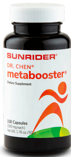
100 capsules #24011