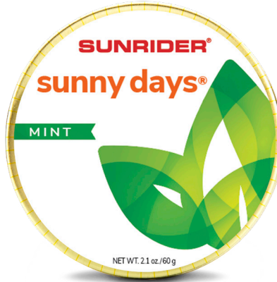
6/2.1 oz. tins #10406