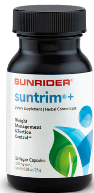
50 capsules #00831