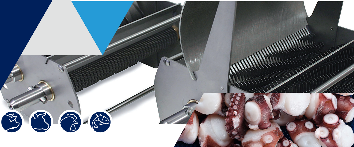
TABLE TOP STRIP CUTTER/TENDERIZER