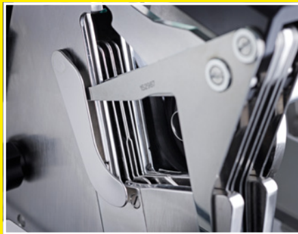
Separator adjustable individually to product calibre – for higher cycle times