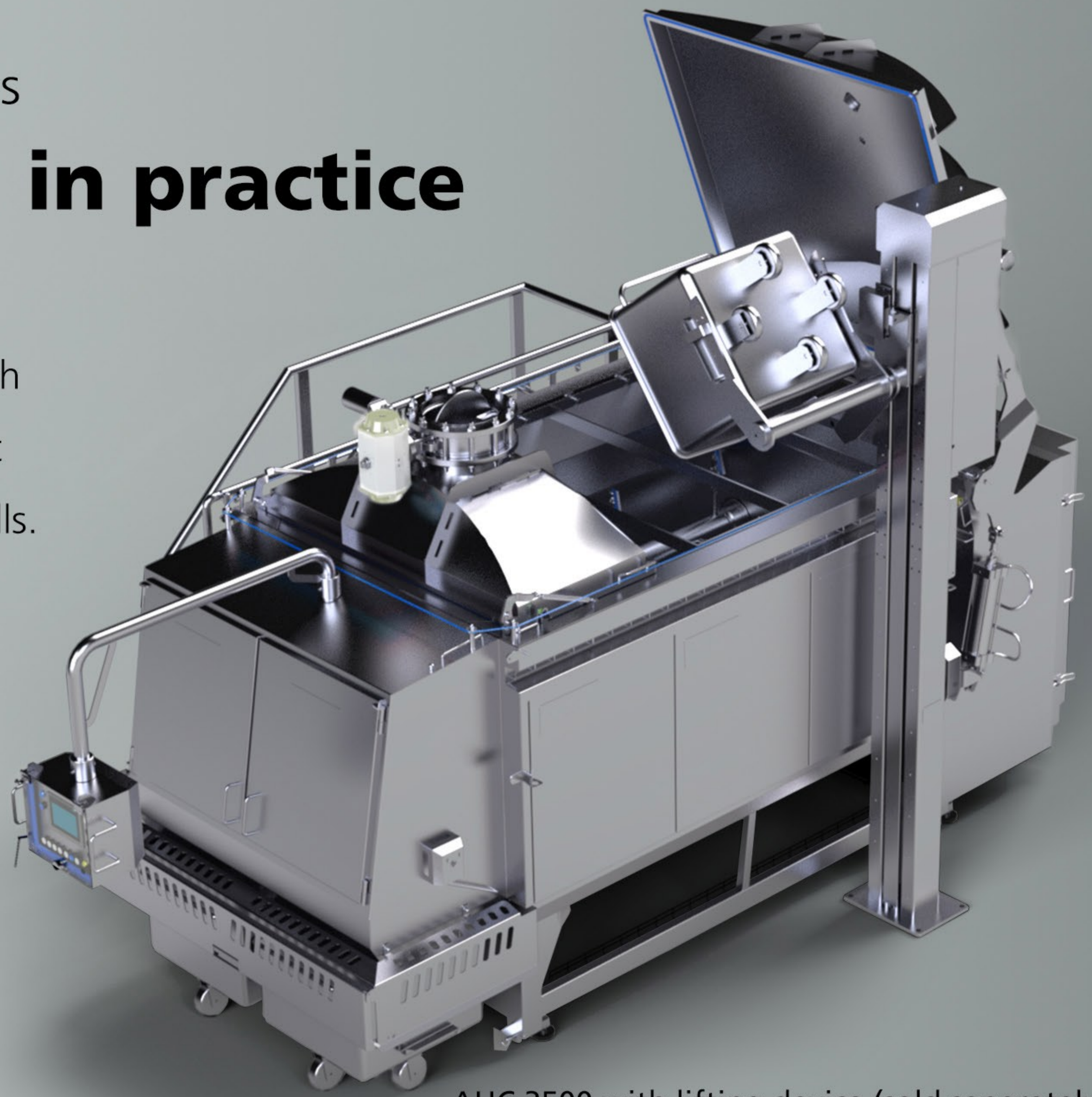
AHC 3500 with lifting device (sold separately)

Rapid heating and high temperatures ensure optimal flavor and freshness preservation.