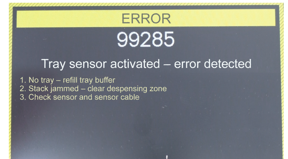
Error indication with help text