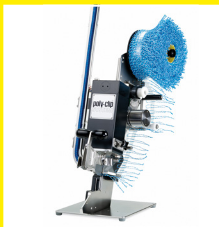
Version with pneumatic cutter and GSE (automatic looper)

specific closing speed and pressure can be set with the pressure regulator assembly.