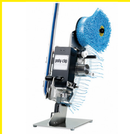
Version with pneumatic cutter and GSE (automatic looper)

reproducibly. In addition, product specific closing speed and pressure can be set with the pressure regulator assembly.