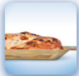
Optional product protrusion