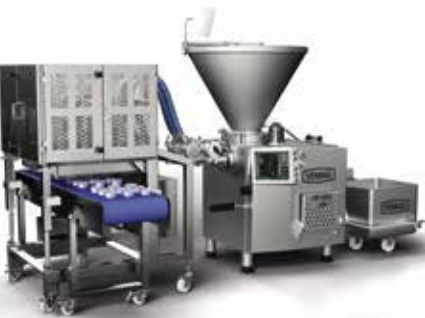
Cup Filling Line