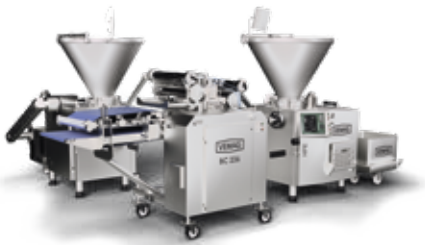
Ball Control BC236

Our VEMAG filling and portioning solutions provide you with powerful, flexible systems that can be combined with our attachments and accessories to enable a wide range of products, efficiently supporting even the most complex production processes.