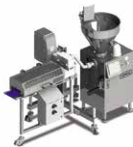
Ball Control BC237