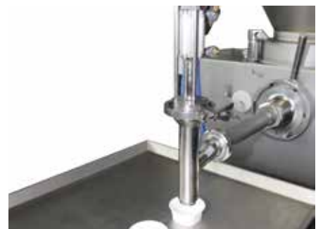
Filling Head 981