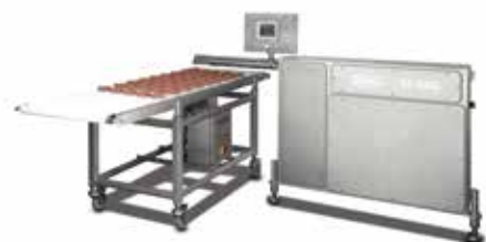
SC260-263 Shuttle Conveyor