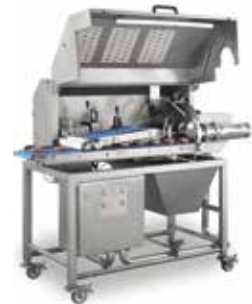
FM250 Forming Machine