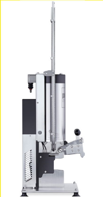
EZ 8080 with optional knife