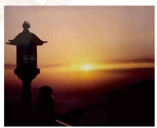
Photograph: Chogosonshiji Temple

http://www.kasugataisha.or.jp/about/index_en.html (→ Special Openings p.4)