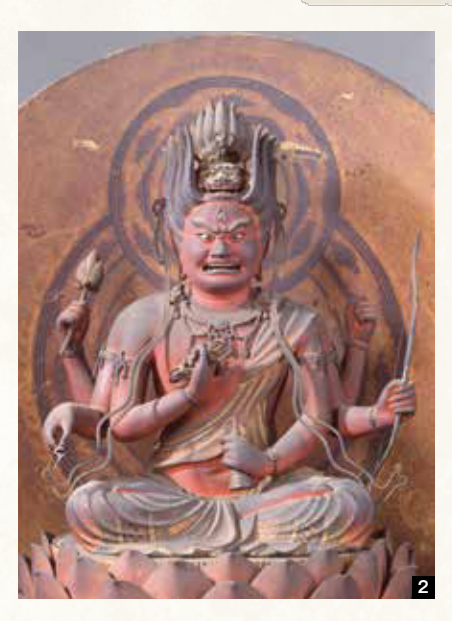
The O-chamori tea ceremony Photograph: Saidaiji Temple 2 Seated Aizen Myo-o statue (Important