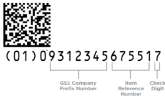
Figure 5 : GTIN-13 represented in a 14-digit format using AI(01)

AI(01) must be followed by 14 digits. A GTIN-13 or a GTIN-12 must therefore be preceded by meaningless Filler zero(s). An example shown in Figure 5 for GTIN-13 with a Filler Zero)