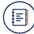
National Product Catalogue