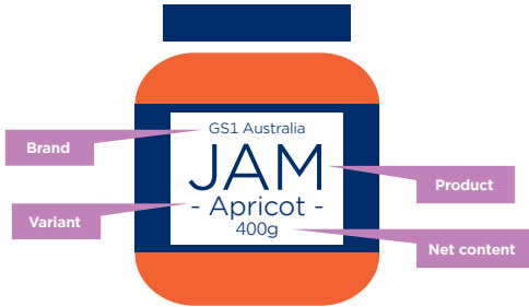
GS1 Australia Apricot Jam 400gm

Please provide the following details, (product description should include the product, brand name, variant, net content (size/net weight/dimensions as applicable) for all products that you wish to obtain an additional Individual Barcode Number (GTIN).