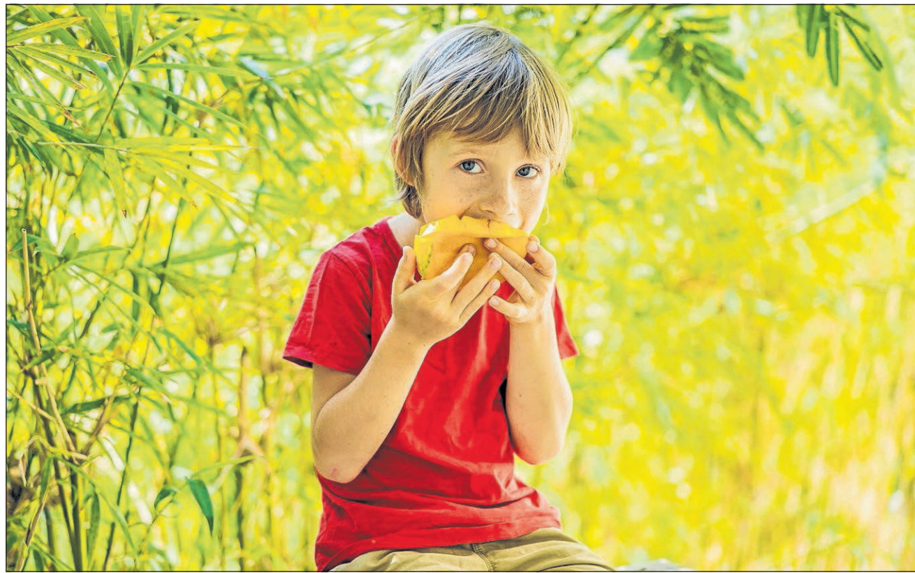
TRUST: Through GS1 Traceability, consumers are able to put their trust in the food they eat and the supply chains that deliver that food.

everyone in the supply chain as it saves an enormous amount of time and money."