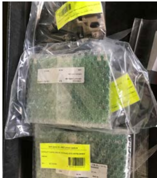
Sydney Trains: 2-part label