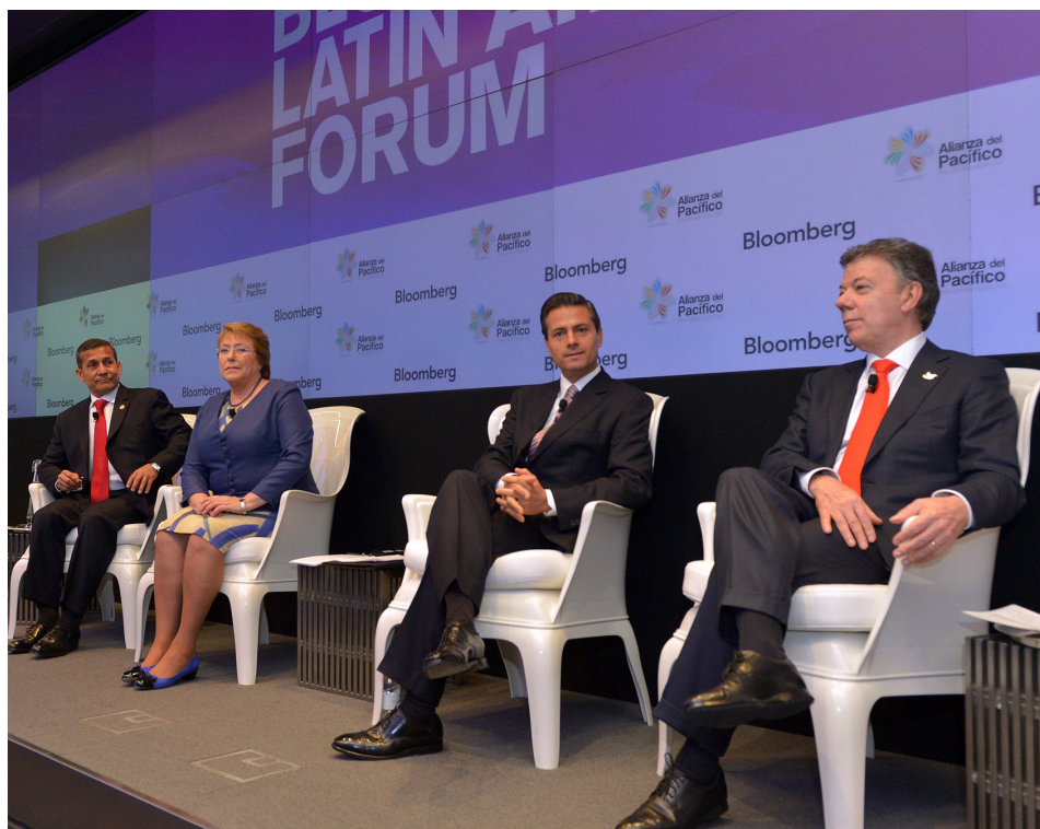
▲ Private sector involvement is essential to fostering commerce among the four countries. Here, Presidents Humala, Bachelet, Peña Nieto, and Santos (left to right) discuss priorities at a 2014 business summit.

In Latin America, the TPP will have the most tangible effects on three Alliance members: Chile, Mexico, and Peru. Yet the results may not be as immediate as some would expect. For example, as Mexico and Chile already enjoy free market access in the major economies participating in the TPP, the effects would