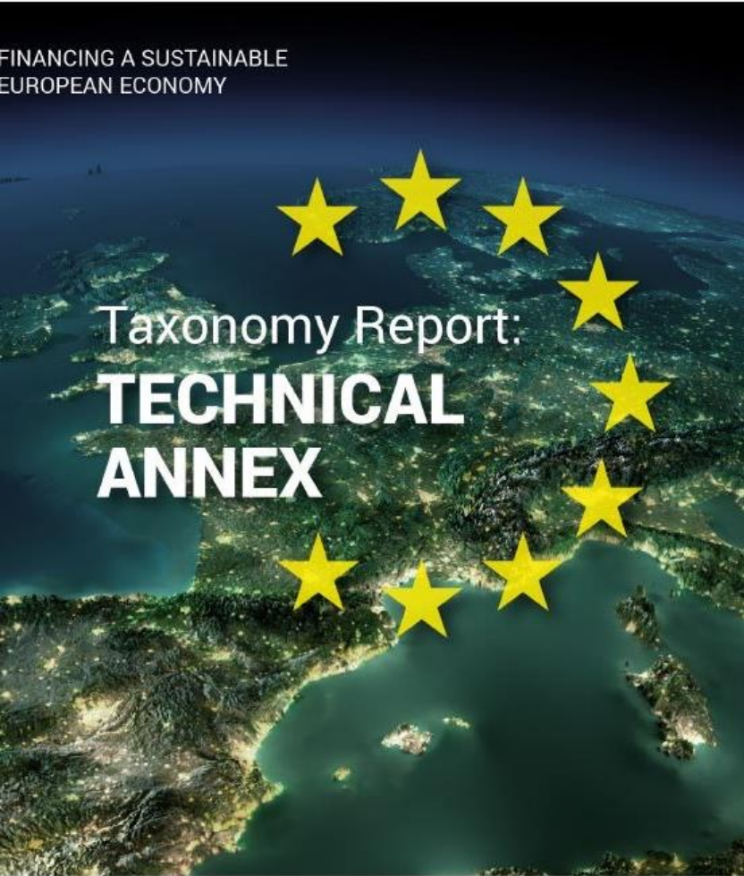
EUs gröna Taxonomi