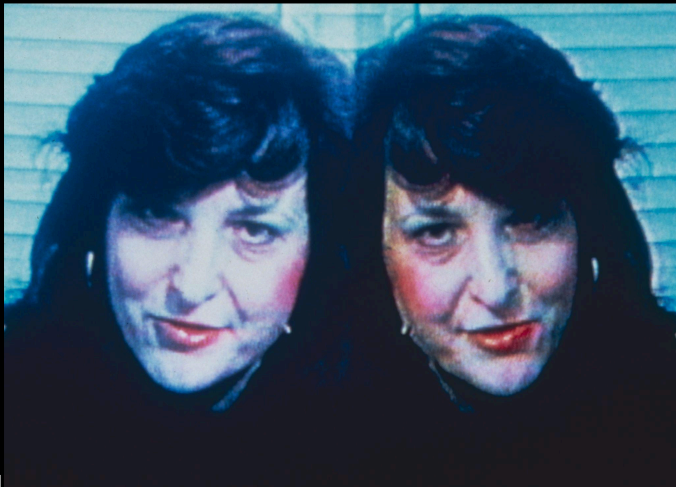
Lynn Hershman Leeson, Binge (still) (1986-87) from The Electronic Diaries , (1984-2019). Image courtesy of the artist; Bridget Donahue, New York; and Altman Siegel, San Francisco.

The 2024 Spring Gala will take place on May 22, 2024, at Guastavino's in New York. Ticketing information is available here .