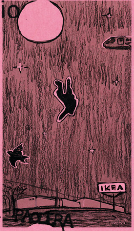
Montez Press Radio "The Song of Dirt Stammers our Tongue" graphic co-presented by The Kitchen and Montez Press Radio.