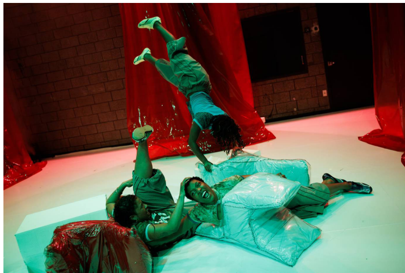
Symara Sarai's Angelic Architectures .

As the lights fade to reveal the twinkle of city lights through the windows in the just-fallen dark, I sense a journey that has come to rest, yet remains ready for anything.