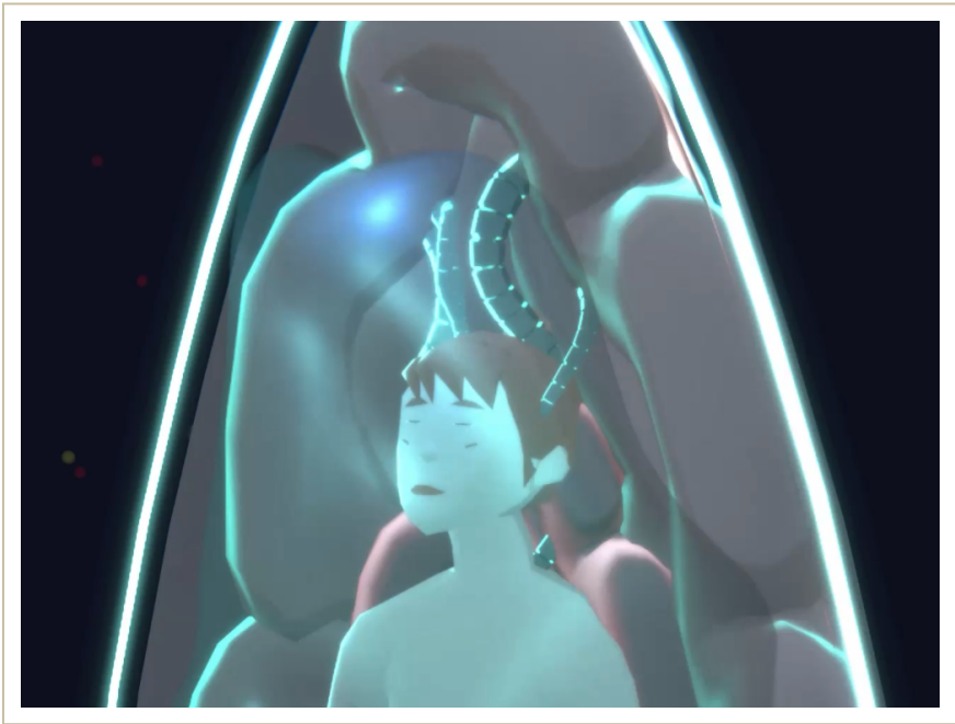
An unauthorised photo of a podster Seedling undergoing The Rebular Process on board Dezima.

The process does not merely provide data; it implants a “foundational narrative” intended to ensure Seedlings integrate seamlessly into unihaven society. By the time a Seedling reaches physiological maturity, they possess a coherent backstory — some have pejoratively called it a “memory flair” — that grants them a sense of purpose and origin before they ever set foot on the surface.