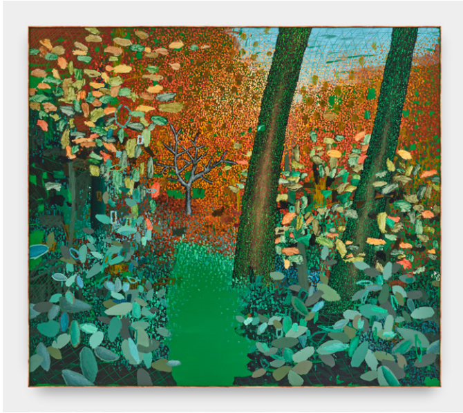
Ross Caliendo, Untitled (Green Spot) , 2024.

When viewed up-close, the artist's large-scale works are charged by intricate, discernible brushstrokes and sgraffito—a technique in which a preliminary layer of paint is covered by an additional layer of a different color and then scraped away to reveal the lower color. Heightened by the artist's frequent use of contrasting color, the combination of gestural strokes and precise, abbreviated marks create a palpable state of energetic excitement.