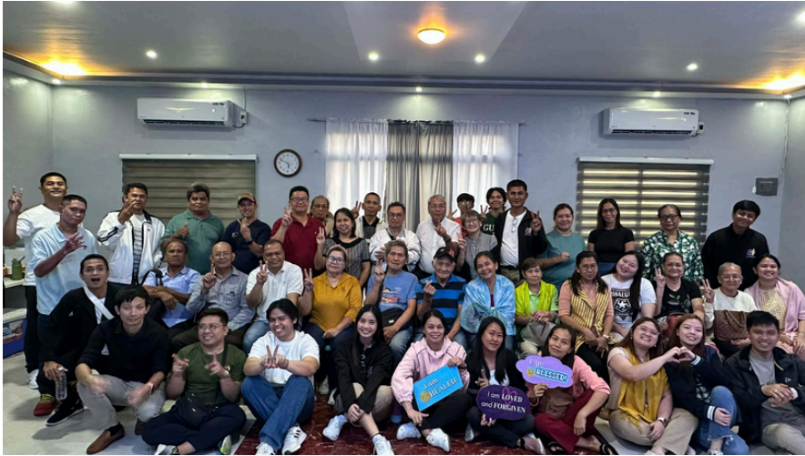
A meaningful moment of fellowship among local churches in the Reset and Retreat