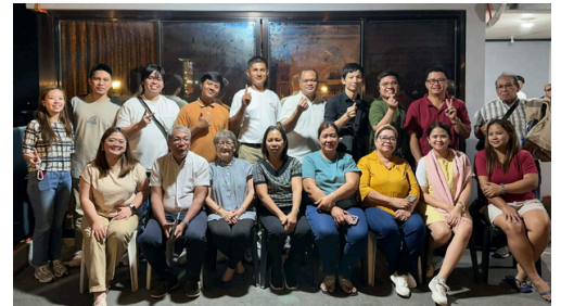
Team members from CTP Batasan, Nagcarlan, and Bulacan gather for a team debriefing after the Reset and Retreat

The Reset and Retreat also highlighted how the Lord continues to work through His people. Leaders who had attended previous retreats stepped up to serve and lead, their growth and willingness to give back becoming a testimony that inspired both participants and fellow team members. Participants showed eagerness not only to learn but also to apply the principles of Holiness, Accountability, Love, and Obedience (H.A.L.O.) in daily life. These learning sessions became a time of renewal, growth, and strengthened commitment for everyone involved.