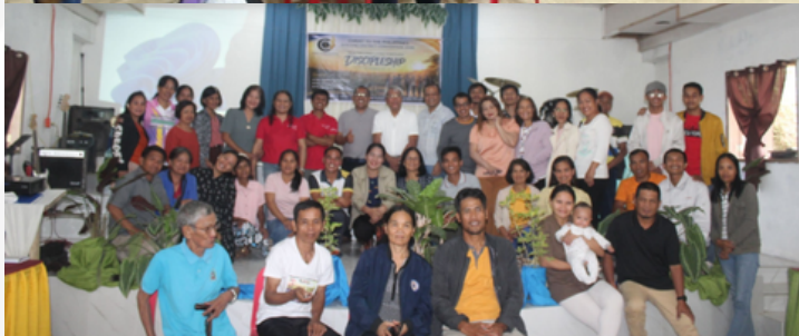
Pastors, Ministers, and emerging leaders representing the Ilocano District gather in prayer and worship during the convention's night service at CTP Taracay

Throughout the sessions, the speakers delivered clear, inspiring, and practical teachings that emphasized the heart of discipleship. A key highlight was the distinction between teaching, mentoring, and disciple-making. Teaching focuses on imparting biblical truth, doctrine, and knowledge so that learners may know God's Word accurately. An example is teaching using a structured material such as the Knowing Christ (Pagkilala) manual, which helps believers grow in their understanding of the faith. Mentoring, on the other hand, emphasizes guidance, advice, encouragement, and wisdom, often focused on leadership or life development rather than full life replication. Disciple-making goes beyond teaching and mentoring by involving life-on-life formation, obedience, character transformation, and multiplication.