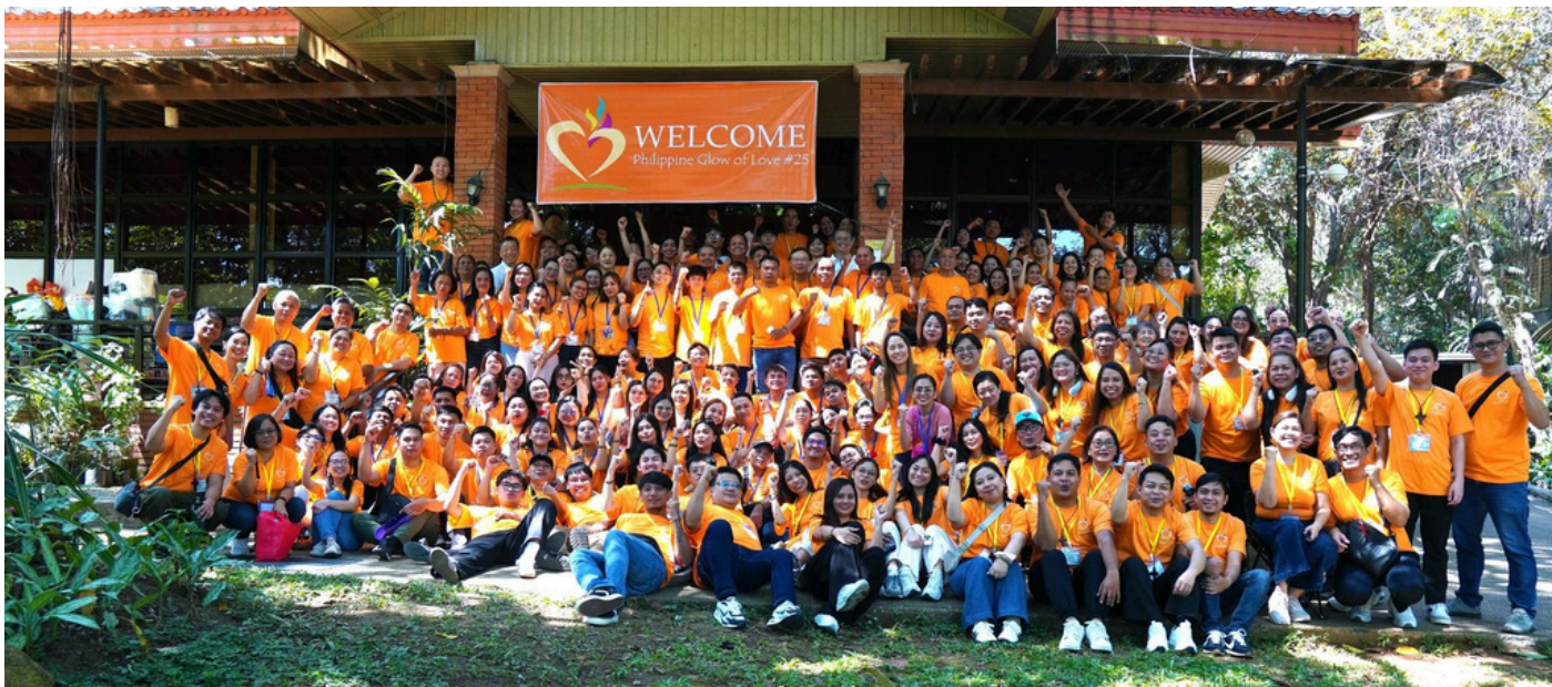
Participants and team members of PGL #25 from the Philippines and USA unite at St. Michael's Retreat House, in a shared experience of God's love and community