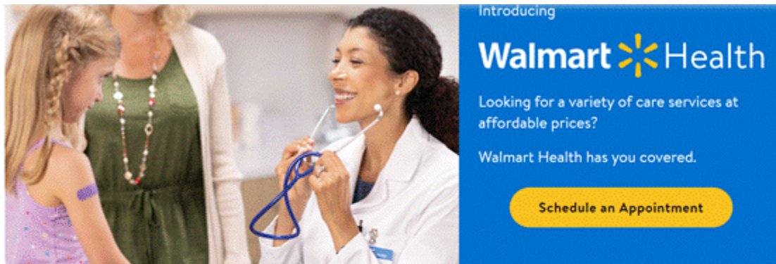
Exhibit 4 Walmart Health Website