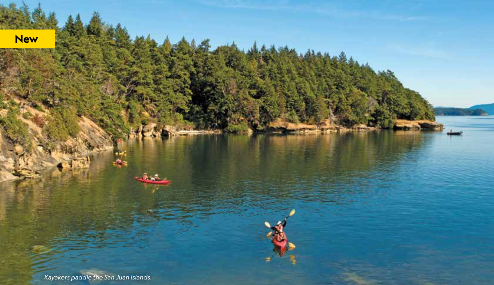
Kayakers paddle the San Juan Islands.