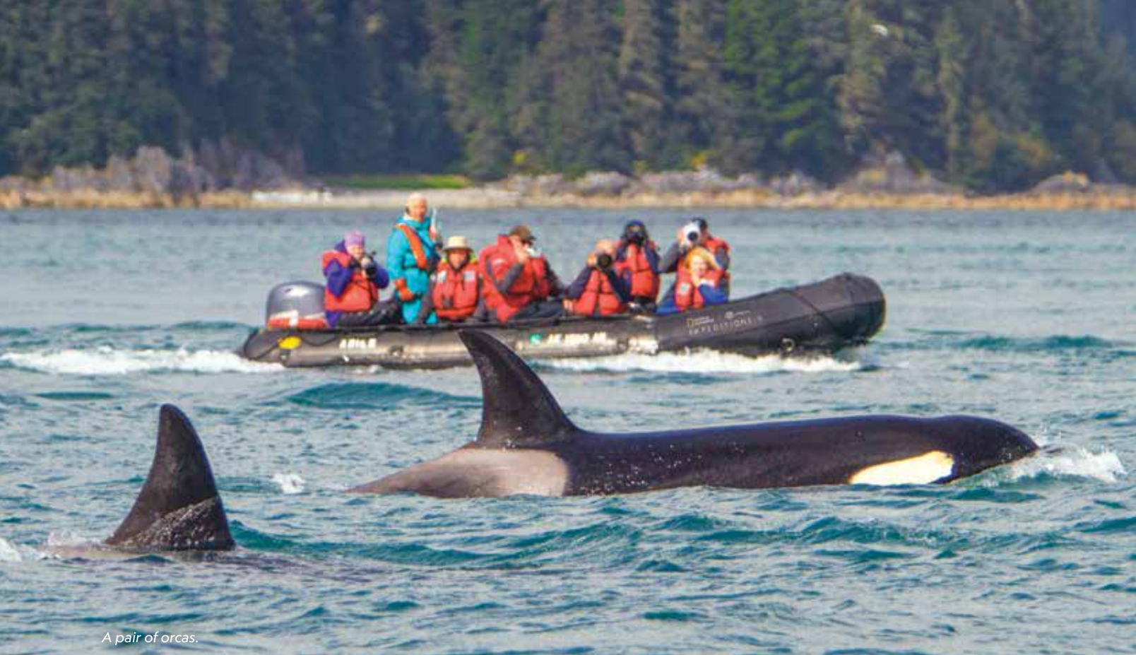
A pair of orcas.