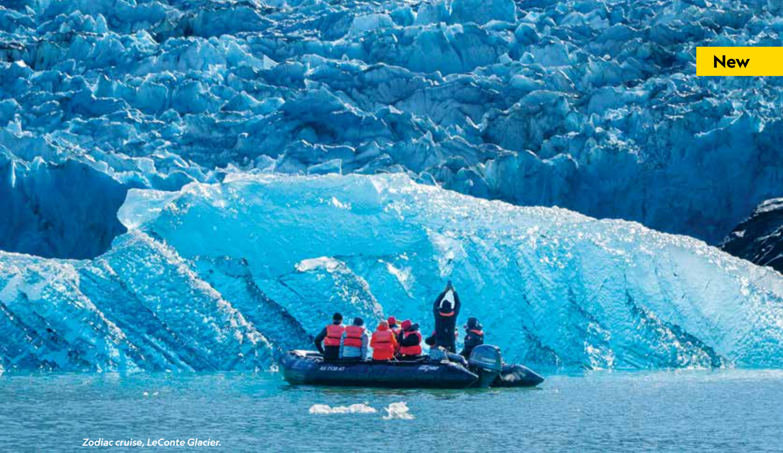
Zodiac cruise, LeConte Glacier.