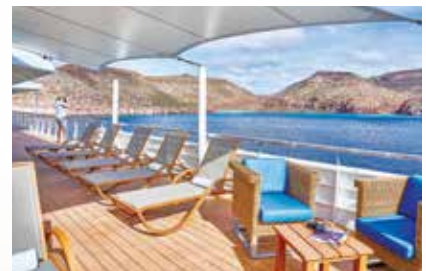
Above: Spacious Category 3 cabin; dining room with floor-to-ceiling windows; comfortable outdoor space for relaxing and wildlife viewing.