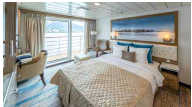
Clockwise from top left: Dining room; observation lounge; Captain’s Suite.