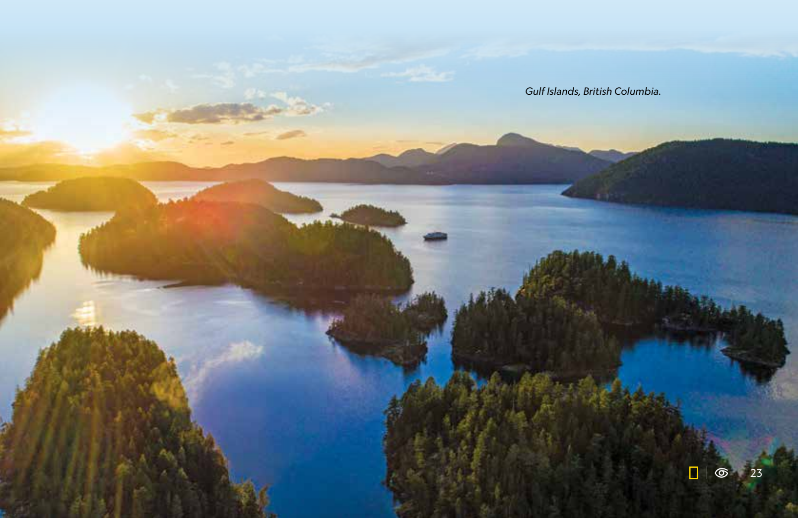
Gulf Islands, British Columbia.