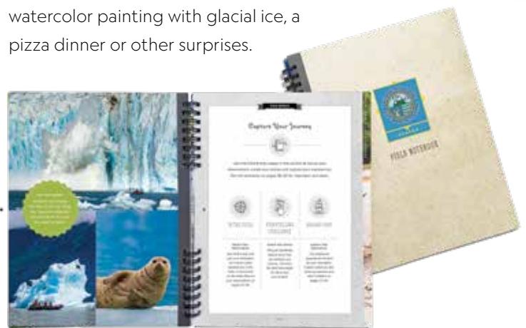
National Geographic Explorers-In-Training field guide.

Meet up with your new friends for fun activities with your certified field educator. Depending on the day, it might be games in the lounge, watercolor painting with glacial ice, a pizza dinner or other surprises.