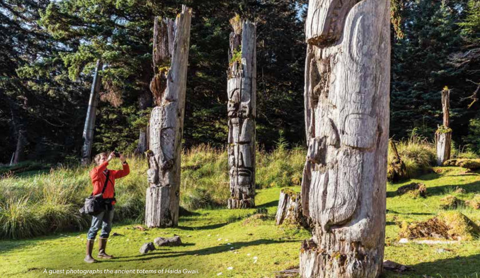
A guest photographs the ancient totems of Haida Gwaii.