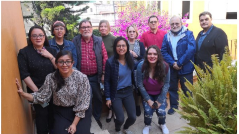
Dec. 10 encounter between AMMPARO delegates and key members of Grupo de Trabajo Sobre Política Migratoria (GTPM) in Mexico City.