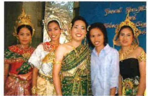
"20 YEARS OF FORMATIVE SERVICE"