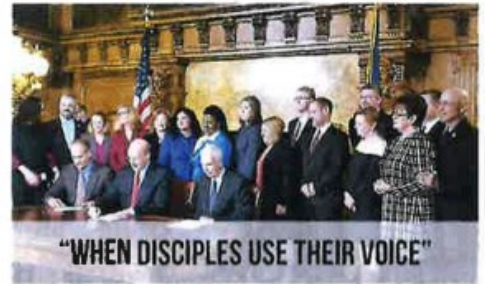
"WHEN DISCIPLES USE THEIR VOICE"