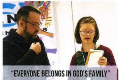
"EVERYONE BELONGS IN GOD'S FAMILY"