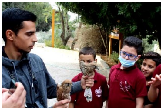
Local schoolchildren learn about bird migration at the ELCJHL's Environmental Education Center.