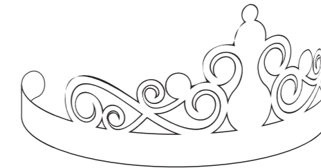
3. Fasten tiara around head