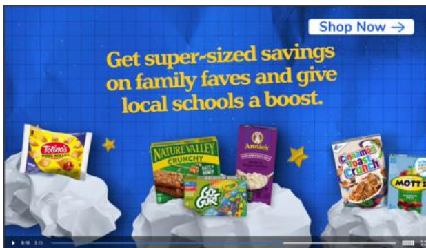
Frame 6 (Final bannerized logo):