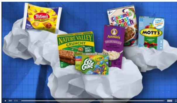
Frame 2 (CTA added):