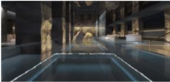
*Bathers are asked to use swimwear when bathing at the Thermal Spring

One of the great pleasures of a visit to Kyoto is experiencing a Thermal Spring. At HOTEL THE MITSUI KYOTO guests can immerse themselves in the healing waters, soaking away stresses and strains in a calming environment surrounded by the soothing sound of running water.