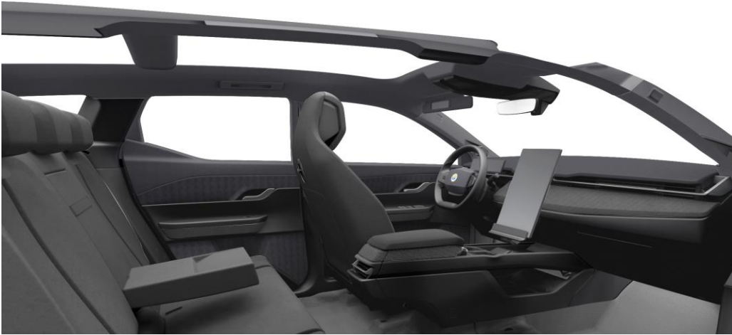
Black Abyss (with dark metallic accent) - standard on all trims