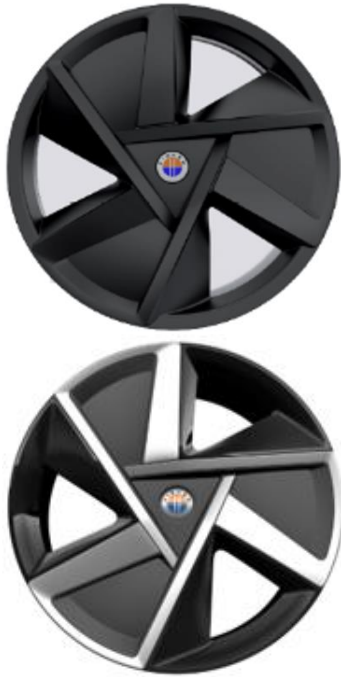
22" F3 Slipstream

Gloss alloy wheel with recycled carbon fiber wheel cover – silver accent or matte