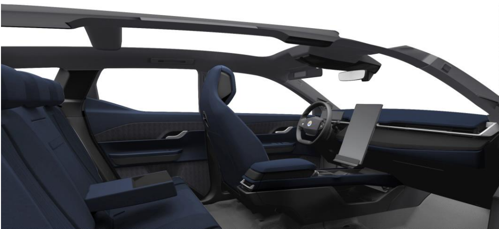
MaliBlu (with bright metallic accent) – optional on Extreme, standard on One