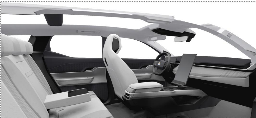
Sea Salt (with bright metallic accent) – optional on Ultra and Extreme