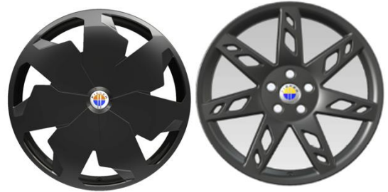
20" F7 Aero Stealth