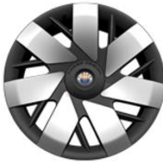
22" F5 AirGlider

Standard on Fisker Ocean One Optional on Extreme, Ultra, Sport