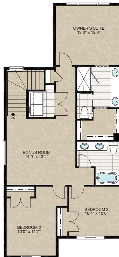
UPPER 1054 SQ.FT.