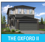
THE OXFORD II