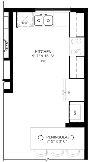
MAIN LEVEL • KITCHEN PENINSULA OPTION