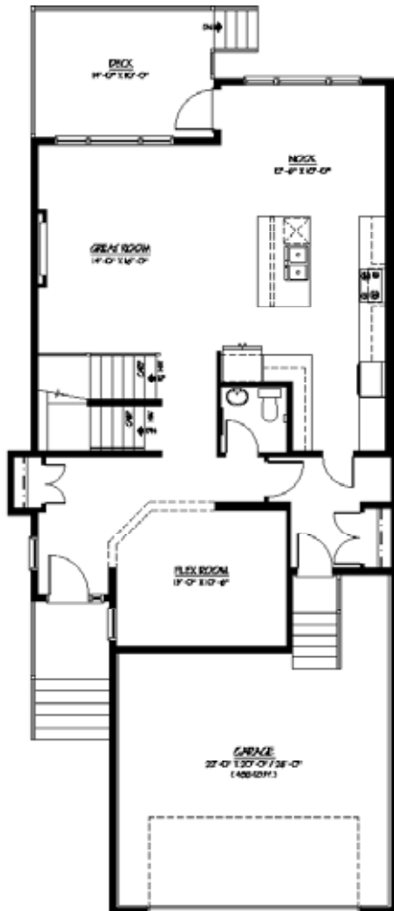
MAIN 1106 SQ.FT.