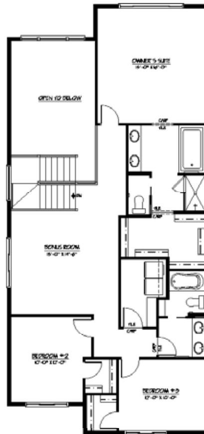
UPPER 1386 SQ.FT.