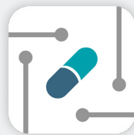
OTC-Anywhere Mobile App