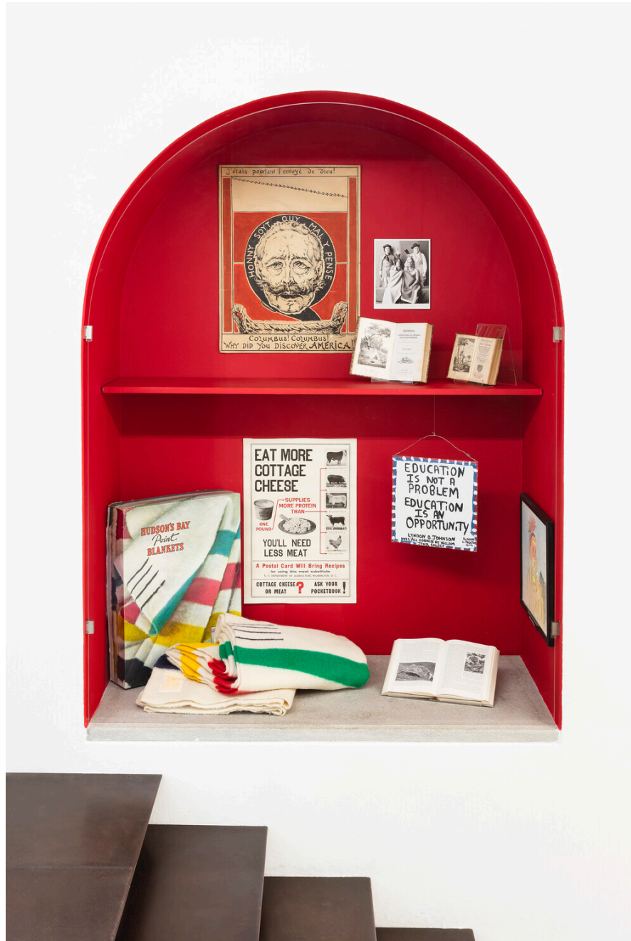
Kasper Bosmans, A Perfect Shop-Front , 2021. Private archive (13 elements: "Americana"), dimensions variable.