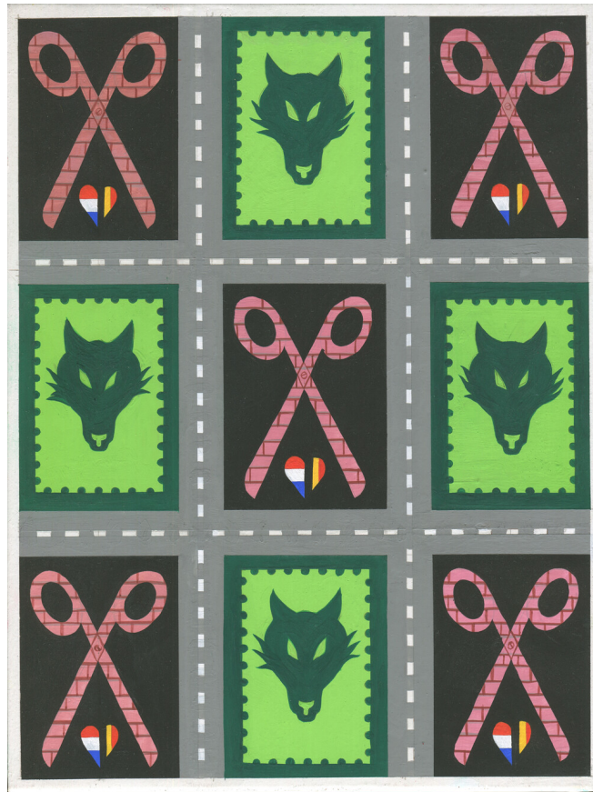
Kasper Bosmans, Legend: A Perfect Shop-Front , 2020. Gouche and silver point on poplar panel, three elements, 21 x 28 cm each.