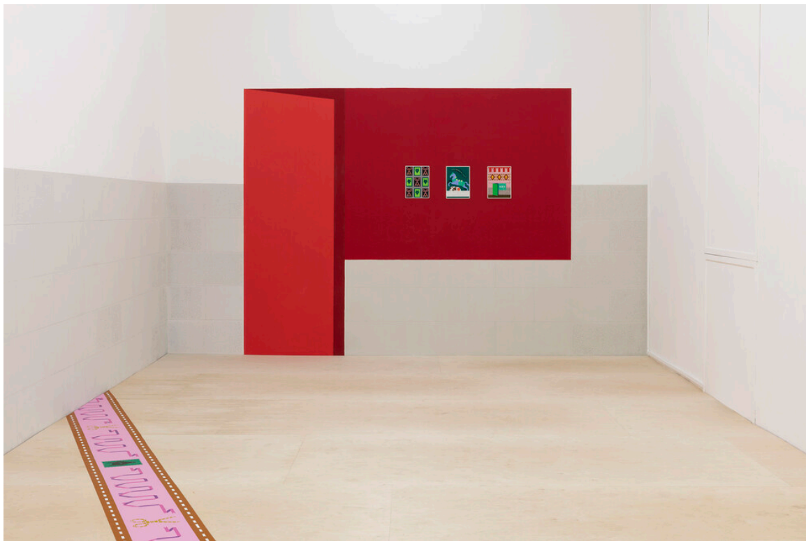
View of Kasper Bosmans's "A Perfect Shop-Front" at Fondazione Arnaldo Pomodoro, Milan, 2021.

Kasper Bosmans has turned the Fondazione Arnaldo Pomodoro outside in. On entering his solo exhibition, the visitor is presented with a reproduction of a stylized city: painted onto the walls in shades of red are two ajar doors; assorted memorabilia can be glimpsed through a window display; a mural resembles a fake stone wall; and a thin pink highway painted on the floor, beside which rests