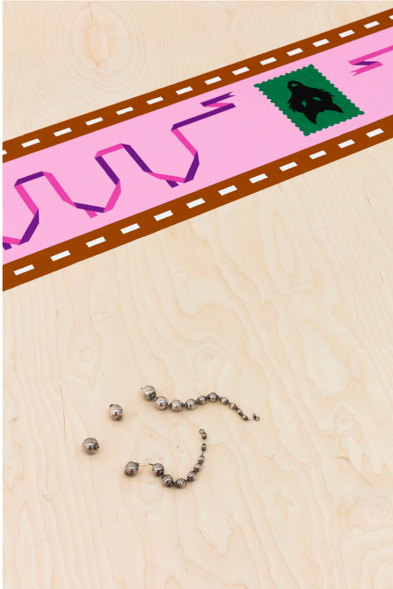
View of Kasper Bosmans's "A Perfect Shop-Front" at Fondazione Arnaldo Pomodoro, Milan, 2021. (Above:) Wolf Corridors & Stamp Forest (detail), 2020. Painted corridor, dimensions variable. (Below:) Lazy Susan , 2020. Necklace, dimensions variable.