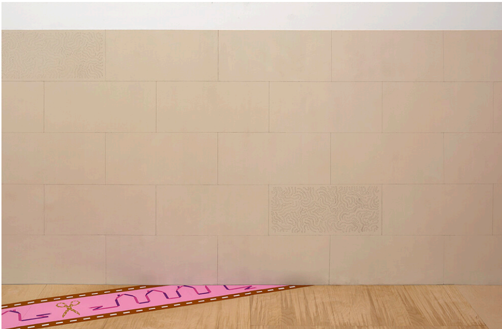
View of Kasper Bosmans's "A Perfect Shop-Front" at Fondazione Arnaldo Pomodoro, Milan, 2021. (Wall:) Vermiculated Rustication , 2016. Mural, dimensions variable. (Floor:) Wolf Corridors & Stamp Forest , 2020. Painted corridor, dimensions variable.