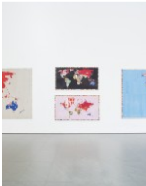
Installation view showing maps

The progression of time intrigued him and he had a particular interest in his own mortality. In "16 Dicembre 2040-11 Luglio 2023" (December 16, 2040-July 11, 2023) Boetti has embroidered two dates: one foreshadowing his 100th birthday and the other his death date. Macabre, yes, but also indicative of his wicked sense of humor.