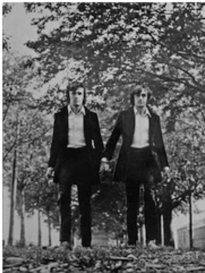
"Gemelli" (1968), photomontage

Duality, opposition and ideas of twinning occupied Boetti throughout his short life and career. In fact, a large photomontage of two Boettis side by side, called "Gemelli" (Twins), greets viewers at the entrance to the exhibition. He subsequently changed his name to Alighiero e Boetti, as if he were two sides of one person or two entirely separate people.