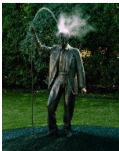
"Self-Portrait" (1993), bronze and electrical and hydraulic components

Leaving the exhibition, I felt that my head could use some cooling off. There was so much to see by this enigmatic Italian artist, impossible to classify in his all too brief 54 years. Fitting then to end the exhibit with a visit to the sculpture garden with Boetti's self portrait in bronze, made a year before he died. The figure holds a hose with running water above his head. As the water hits the head -- engineered to run hot during museum hours -- a cloud of steam is released.