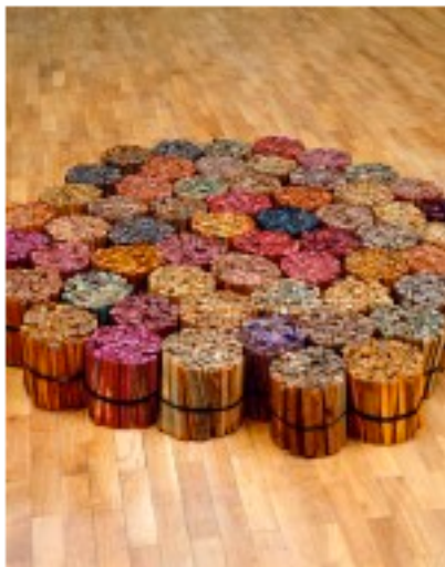
"Legnetti Colorati" (1968), wood, synthetic polymer paint, elastic bands

"Cubo" (Cube) is a mash up of wood, fiberglass, cardboard, plastic, glass, rubber, polystyrene, steel rods and wire wool all glued together and viewed through a Plexiglas box. In "Legnetti Colorati" (Little Colored Sticks) bundles of common wood are artfully arranged to create a blossom pattern on the floor.