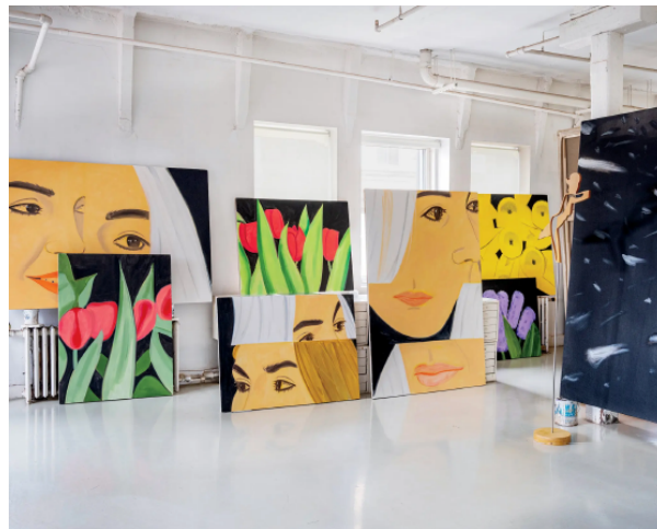
Works in Katz's SoHo studio include split portraits and flower paintings.