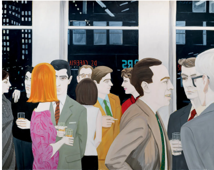
One of the artist's early group portraits, "The Cocktail Party" (1965). © 2022 Alex Katz/Licensed by VAGA at Artists Rights Society (ARS), New York