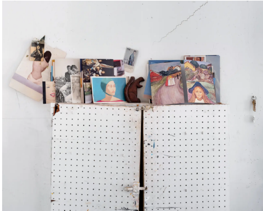
A few sources of inspiration atop a tool cabinet in the artist's studio.