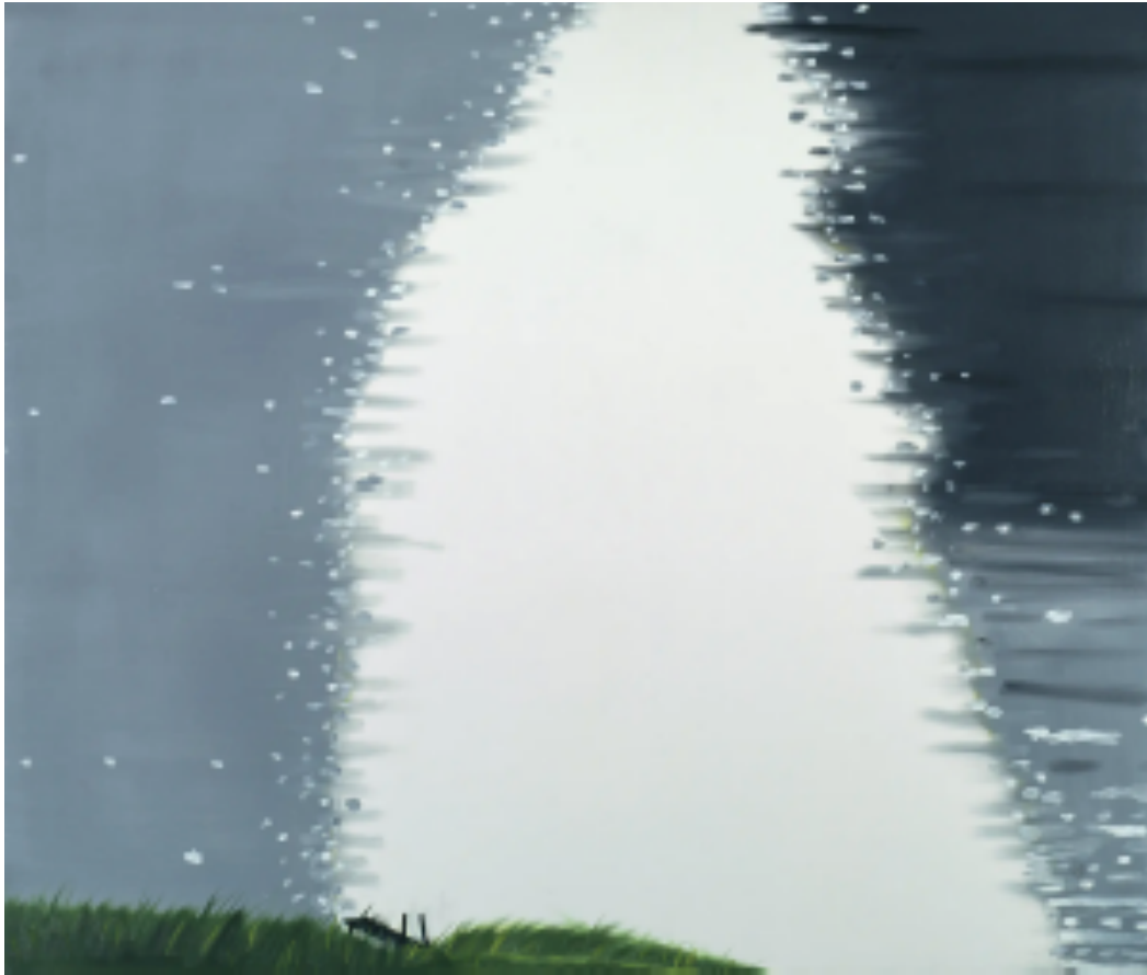
"Lake Light" (1992), a landscape of Maine, where Katz has been spending his summers painting since 1949.