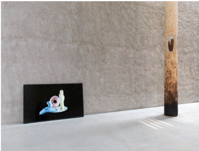
Claudia Comte When Dinosaurs Ruled the Earth 2018 Installation view

Because of and in spite of this, marble is a material that interests me, it signifies ancient times and stability of sorts. Marble is made of the oceans, the white parts are compressed shells and thus animal based materials. The grey and black parts are minerals. I feel very fortunate to have the opportunity to make sculptures with materials that have so much life and history.