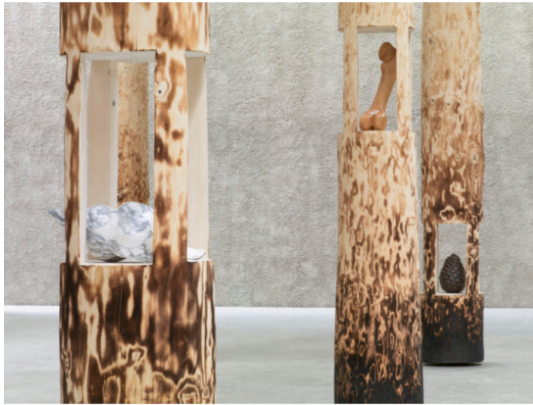
Claudia Comte When Dinosaurs Ruled the Earth 2018 Installation view

WHITEWALL: How do you generally get started on your projects? What comes first, the execution with the material or the idea that lays behind it?