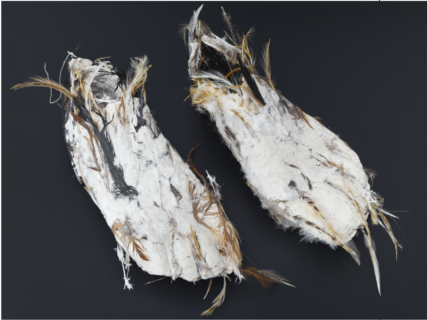
Carlos Villa, Artist's Feet , 1979–80 Paper pulp, feathers; two pieces, each approx. 13 x 38 x 18 cm

© Mary Valledor, Estate of Carlos Villa.