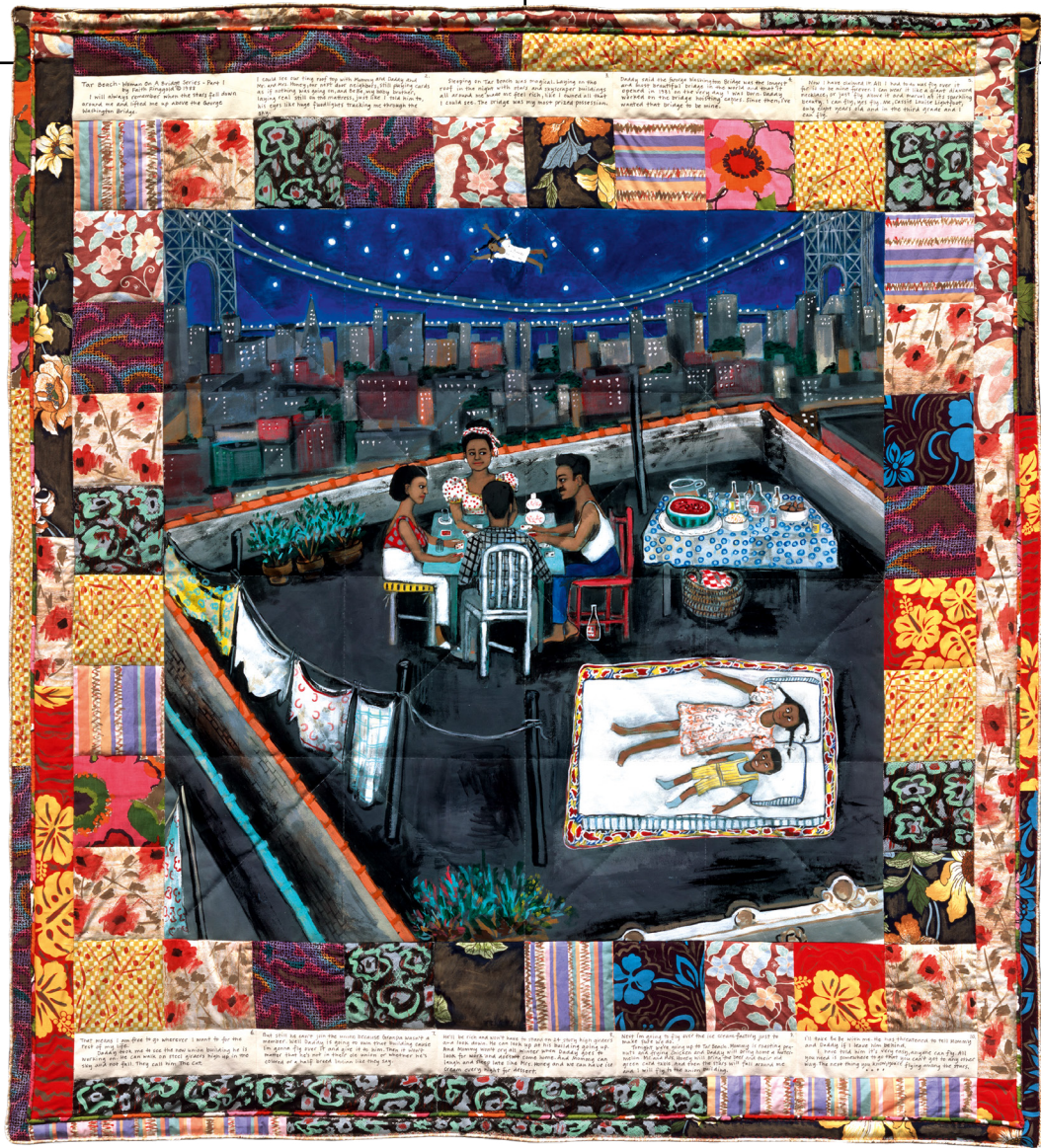
Woman on a Bridge #1 of 5: Tar Beach, 1988 Acrylic paint, canvas, printed fabric, ink, and thread, 189.5 x 174 cm