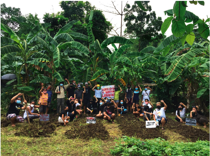
SAKA No to Illegal Demolition Campaign 2021

AMY LIEN (*1987, Dallas) & ENZO CAMACHO (*1985, Manila) have been collaborating since 2009. Through a variety of mediums such as video, sculpture, performance, drawing, and a constant use of modest materials (such as light, paper, strings, and sticks), their practice often involves an immersive period of research or living within a specific locality, with the aim of addressing traces of labour and capital as entangled with colonialism. The duo has had recent solo exhibitions at 47 Canal (2022), CP Project Space (2019), both in New York, and Kunstverein Freiburg (2018). Recent group exhibitions include 2021 Triennial: "Soft Water Hard Stone", New Museum, New York; Manifesta 13 Marseille; "100 Drawings From Now", The Drawing Center, New York (both 2020).