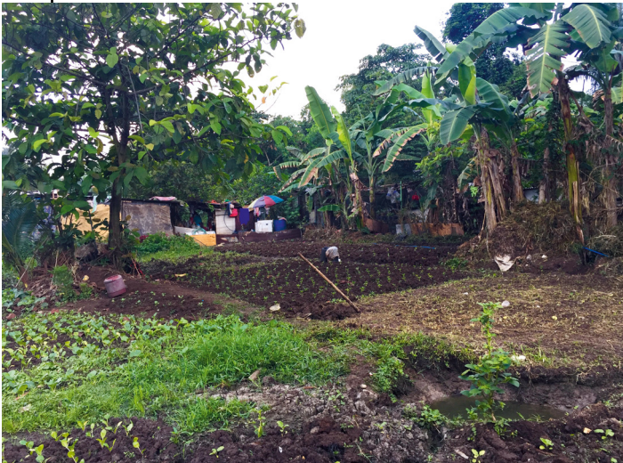
SAKA, Bungkalan LAND Project Collaboration with ARPAK (Artists for Cultural Revolution), 2022