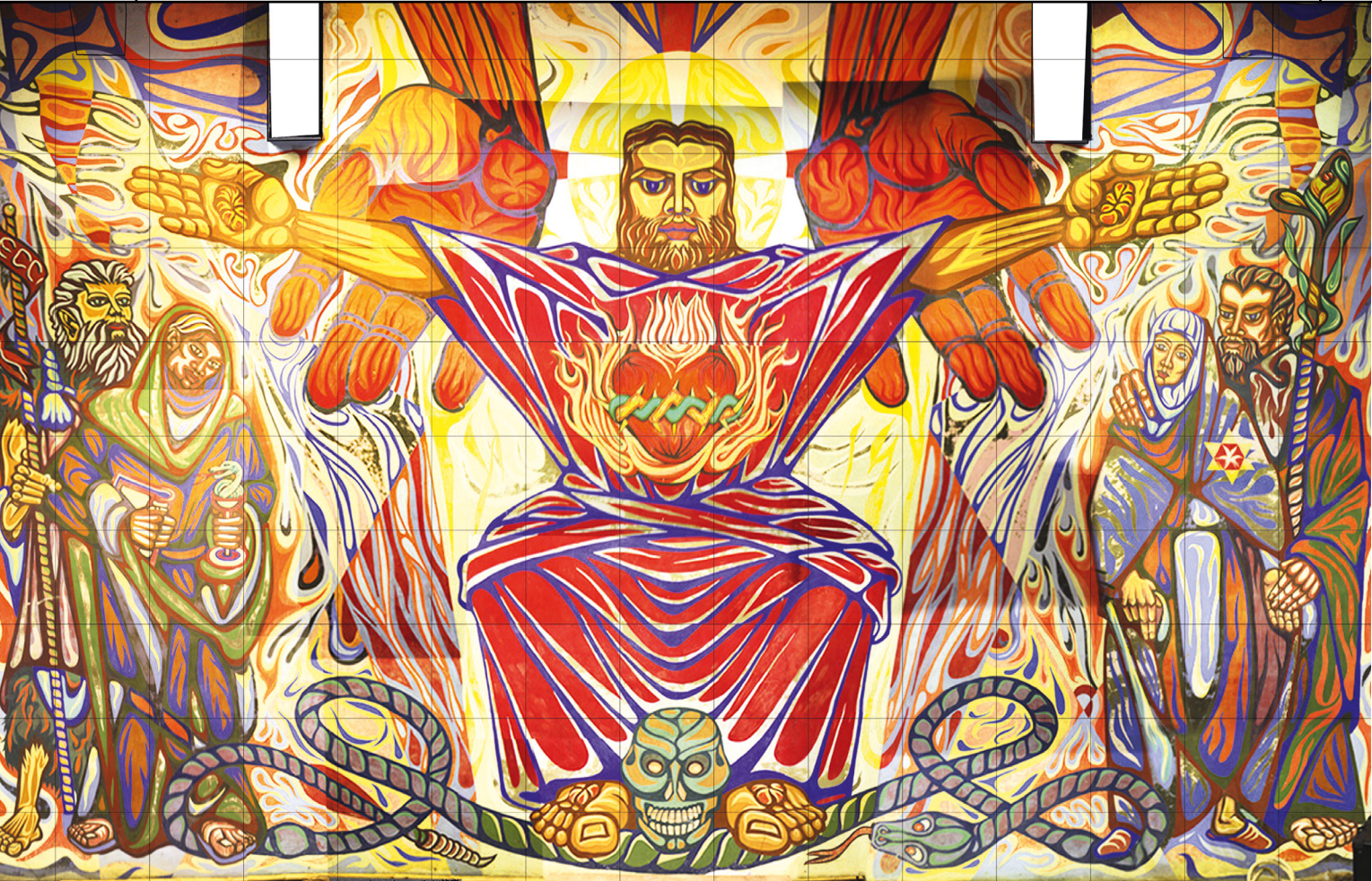
Alfonso Ossorio, The Last Judgment (The Angry Christ) , 1950 Mural in the St. Joseph the Worker Chapel, located inside the Victorias Milling Company, City of Victorias, Philippines

Born 1916 in Manila, died 1990 in New York.