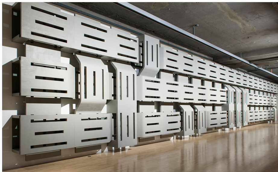
Installation view of German artist Thomas Bayrle's exhibition at the Lenbachhaus museum in Munich. Pictured, Autobahn , 2016. Courtesy of Lenbachhaus. © The artist and VG Bild-Kunst, Bonn 2016

Beneath the remains of the 19th century 'palace' that the Bavarian society portraitist Franz von Lenbach constructed for himself lies a concrete bunker linking what is now the Lenbachhaus museum to Munich's metro system. It currently hosts an exhibition of sculpture and film by German pop artist Thomas Bayrle.