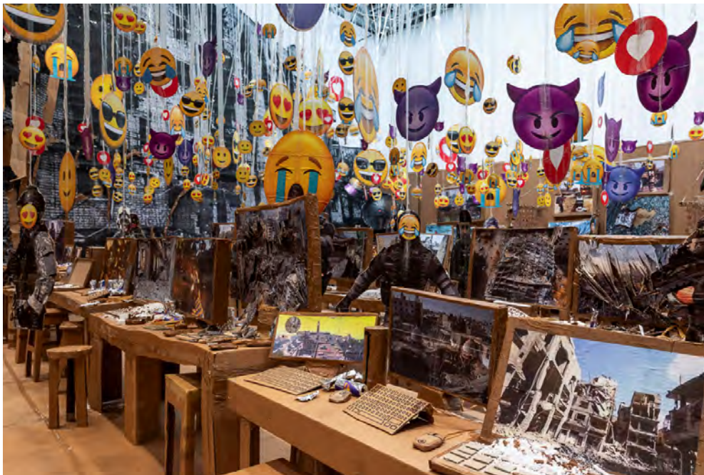
Thomas Hirschhorn: Fake it, Fake it – till you Fake it., installation view. Courtesy the artist and Gladstone Gallery. © Thomas Hirschhorn / Artists Rights Society.

Our contemporary morass, constructed out of cardboard, tape, and foil.