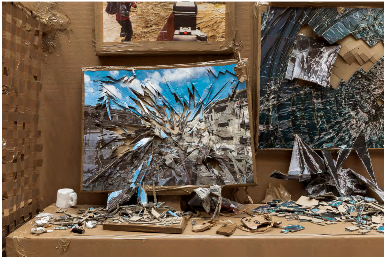
Thomas Hirschhorn, Fake it, Fake it - till you Fake it , 2023 (detail). Cardboard, prints, tape, polystyrene, and aluminum foil. © Thomas Hirschhorn / Artists Rights Society.