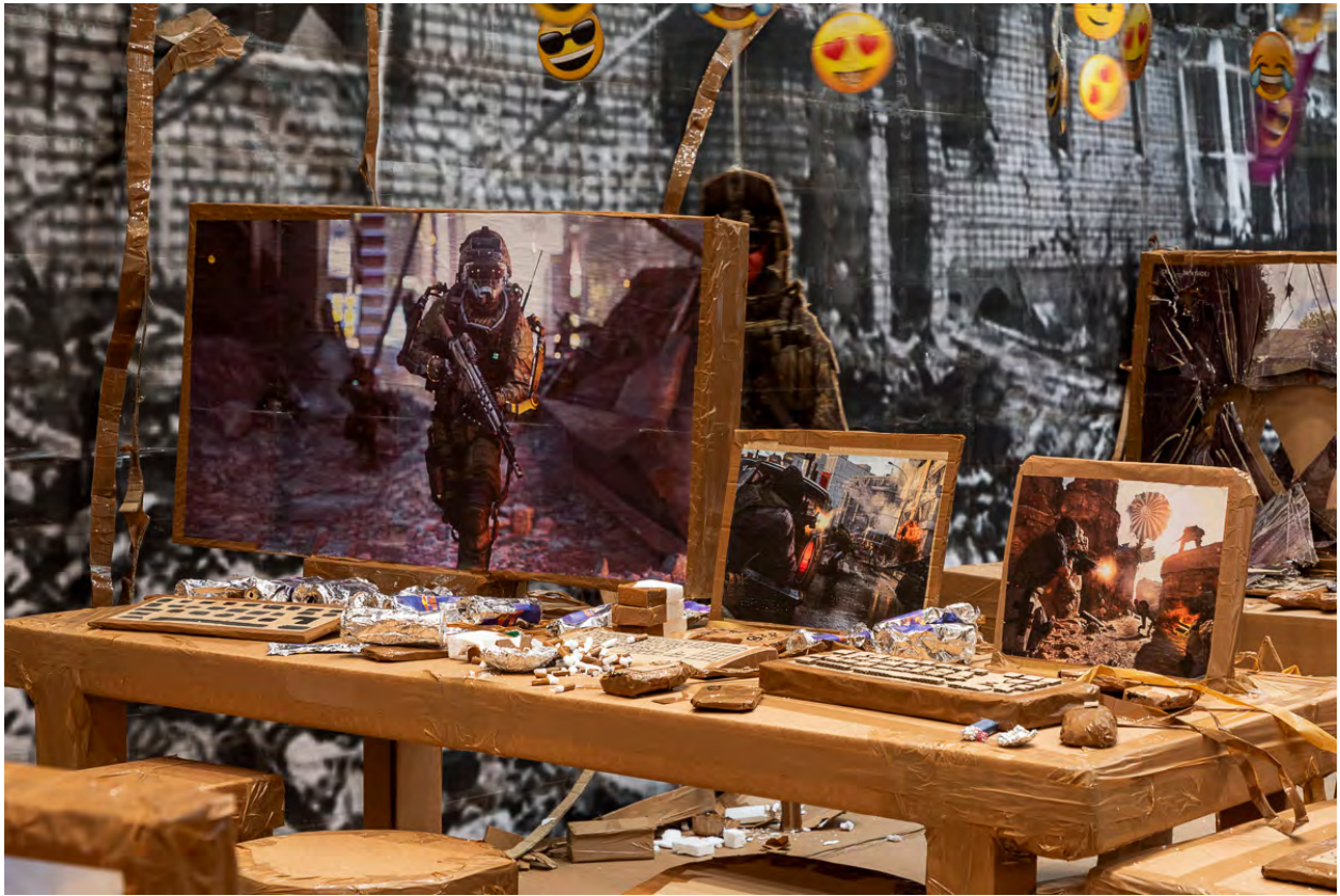
Thomas Hirschhorn: Fake it, Fake it - till you Fake it. , installation view. Courtesy the artist and Gladstone Gallery. © Thomas Hirschhorn / Artists Rights Society.

isn't it the case that emojis don't cover the real, but comprise it? Fake it is a kind of cracked-cave account of our own contemporary morass, in which images and things have equal force. It's a heavy-handed allegory, for sure, but not wrong because of it. Hirschhorn's work has always been marked by a refreshing lack of subtlety. Overflowing with ambition (and possibly hubris?), it's direct in the extreme.