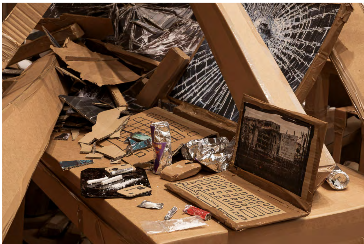
Thomas Hirschhorn, Fake it, Fake it - till you Fake it. , 2023 (detail). Cardboard, prints, tape, polystyrene, and aluminum foil. Courtesy the artist and Gladstone Gallery. Photo: David Regen. © Thomas Hirschhorn / Artists Rights Society.

destruction—mostly bombed buildings in Gaza and Ukraine—and frames from first-person-shooter video games. Gathered around each screen lies what might be called binge paraphernalia : smashed cans of Red Bull, credit cards and cocaine, lighters, Marlboro cigarettes, BlackBerrys, and I ❤️ NY mugs, all made out of supply closet staples, that ubiquitous cardboard and Styrofoam, along with aluminum foil, markers, and tape. Standees of camouflaged soldiers dot the room as if taking it by siege. Some have large emojis—crying, smiling, and cry-smiling—instead of human faces; many more emojis hang from the ceiling like a coming storm. An industrial fan blasting from the back corner adds to this feeling of inclement weather, threatening to render the ad hoc exhibition even more precarious (a favorite word of Hirschhorn's) than it already is.